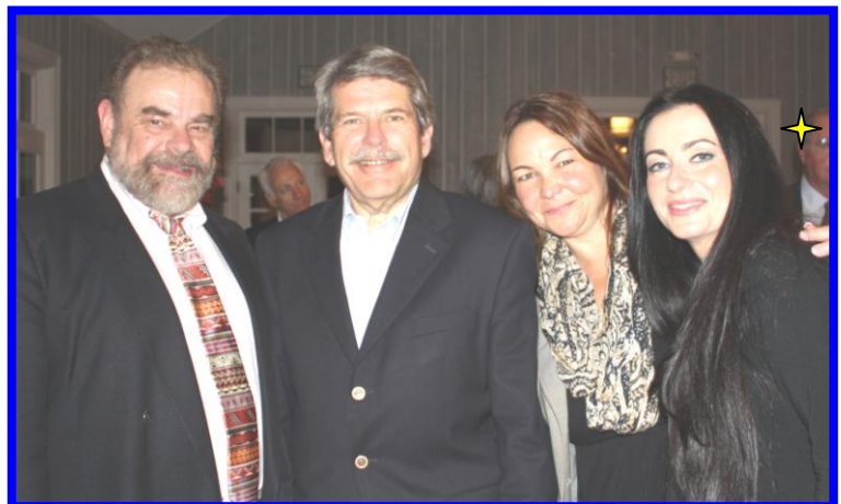
LVHF Banquet 2012